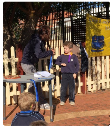
Year Three Sacrament of Reconciliation